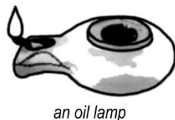
an oil lamp

Jesus said this just before He performed the miracle of making the blind man able to see. He meant that He is the light that will show us how to live right. He also meant that He will show up sin (wrong things) in the world.