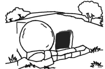
Jesus is risen!

14. What miracle did Jesus do in verse 19?