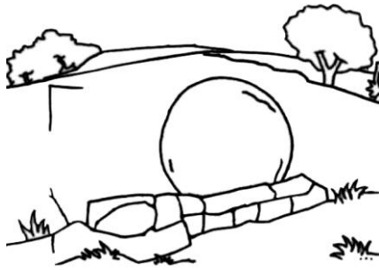
a stone closed the tomb

10. In Lesson 1, there is a very important verse in the Gospel of John. It begins, "For God so loved the world that ...". Write it on the lines on the cross under question 9 (it's John 3:16).