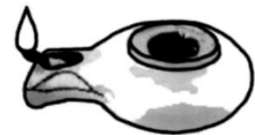
an oil lamp

Jesus said this just before He performed the miracle of making the blind man able to see. He meant that He is the light that will show us how to live right. He also meant that He will show up sin (wrong things) in the world.