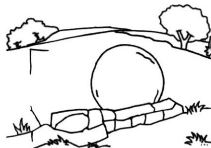
a stone closed the tomb