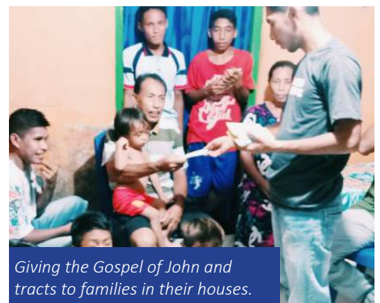
Giving the Gospel of John and tracts to families in their houses.