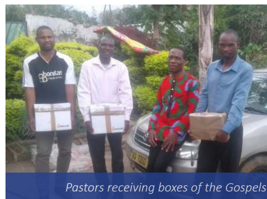
Pastors receiving boxes of the Gospels