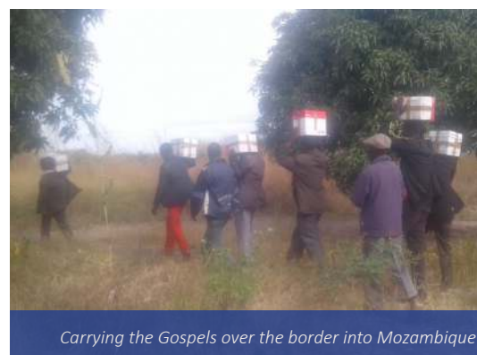
Carrying the Gospels over the border into Mozambique