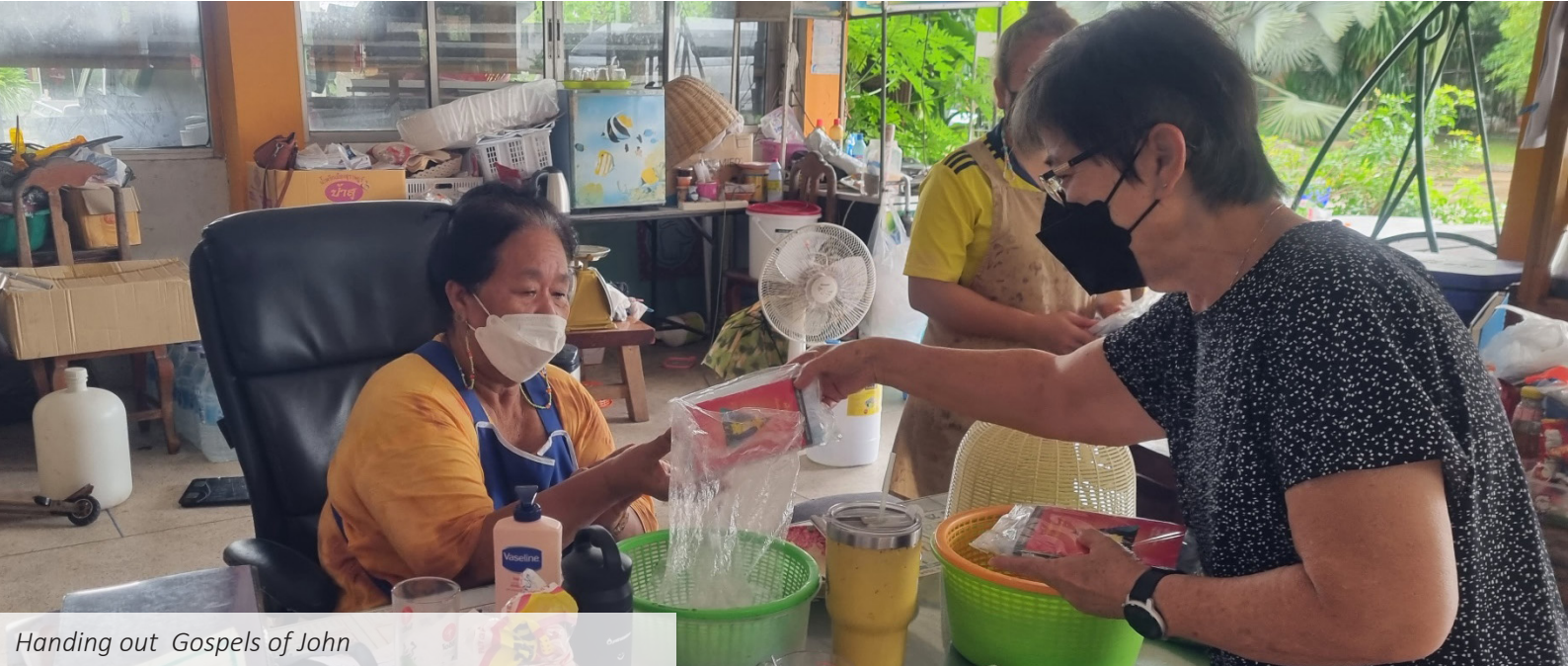
Handing out Gospels of John