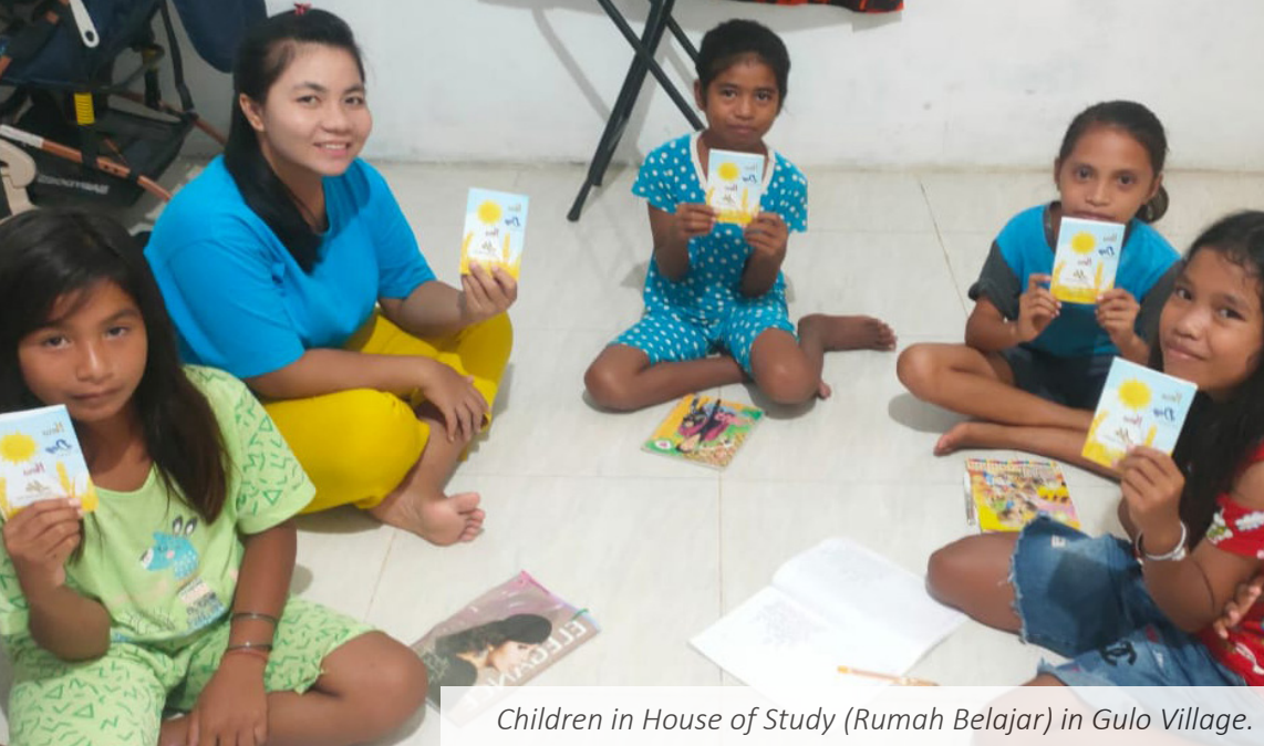
Children in House of Study (Rumah Belajar) in Gulo Village.