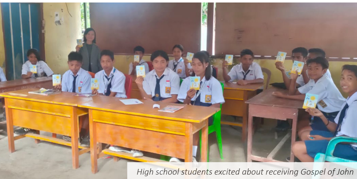
High school students excited about receiving Gospel of John

The picture below is of some students in high school. They are so excited and feel blessed to receive the Gospels. Some of their parents don't believe in God and some students feel hurt and hate for their parents as they have been treated badly. But after we took them through the correspondence course and read the Gospel they learnt about loving God and loving people, and they now want to forgive their parents and the people that have hurt them. Praise the Lord.