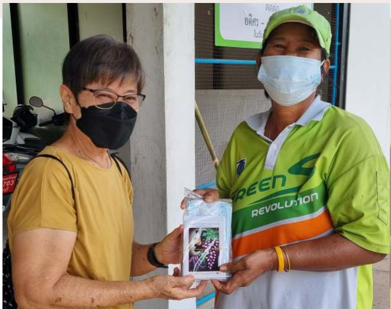
Sharing Gospels of John